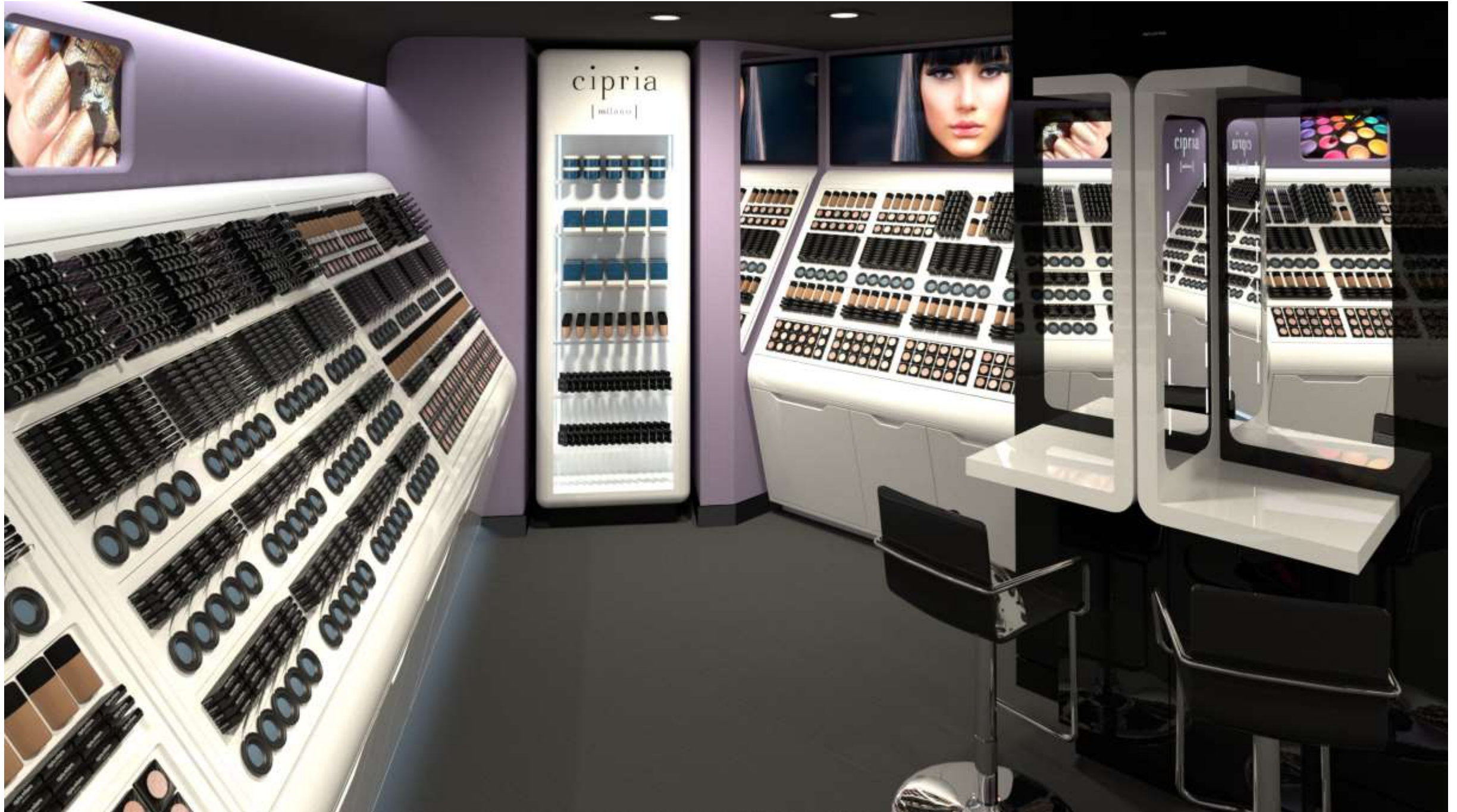
Make up station area