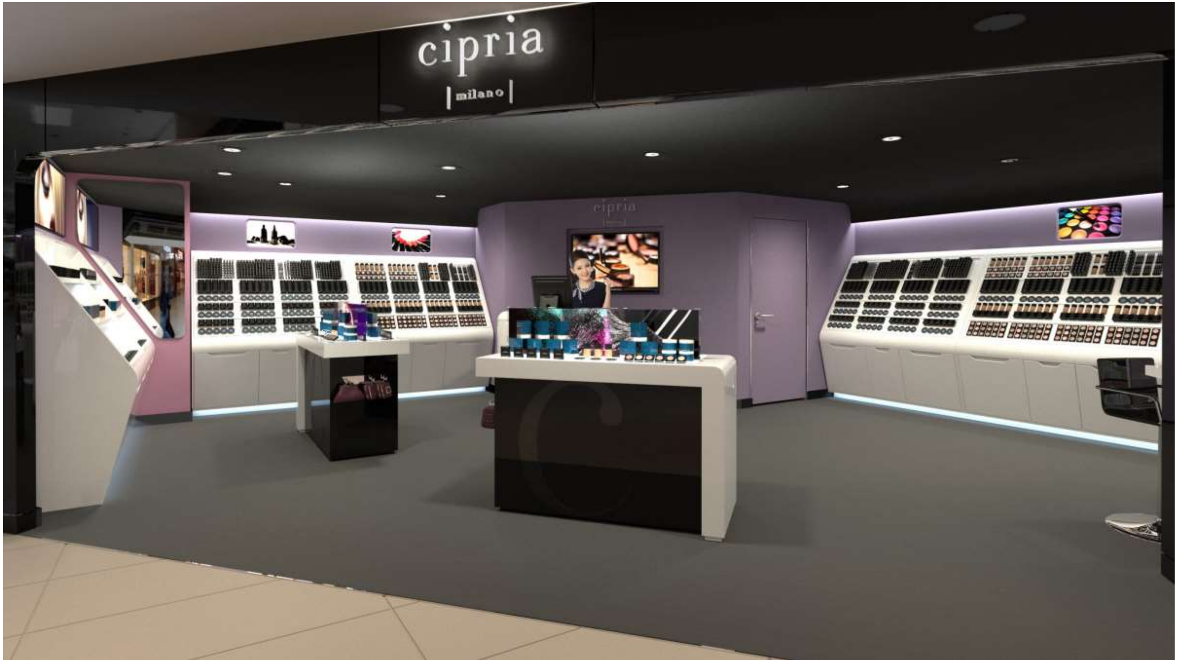
Front View –Open Doors