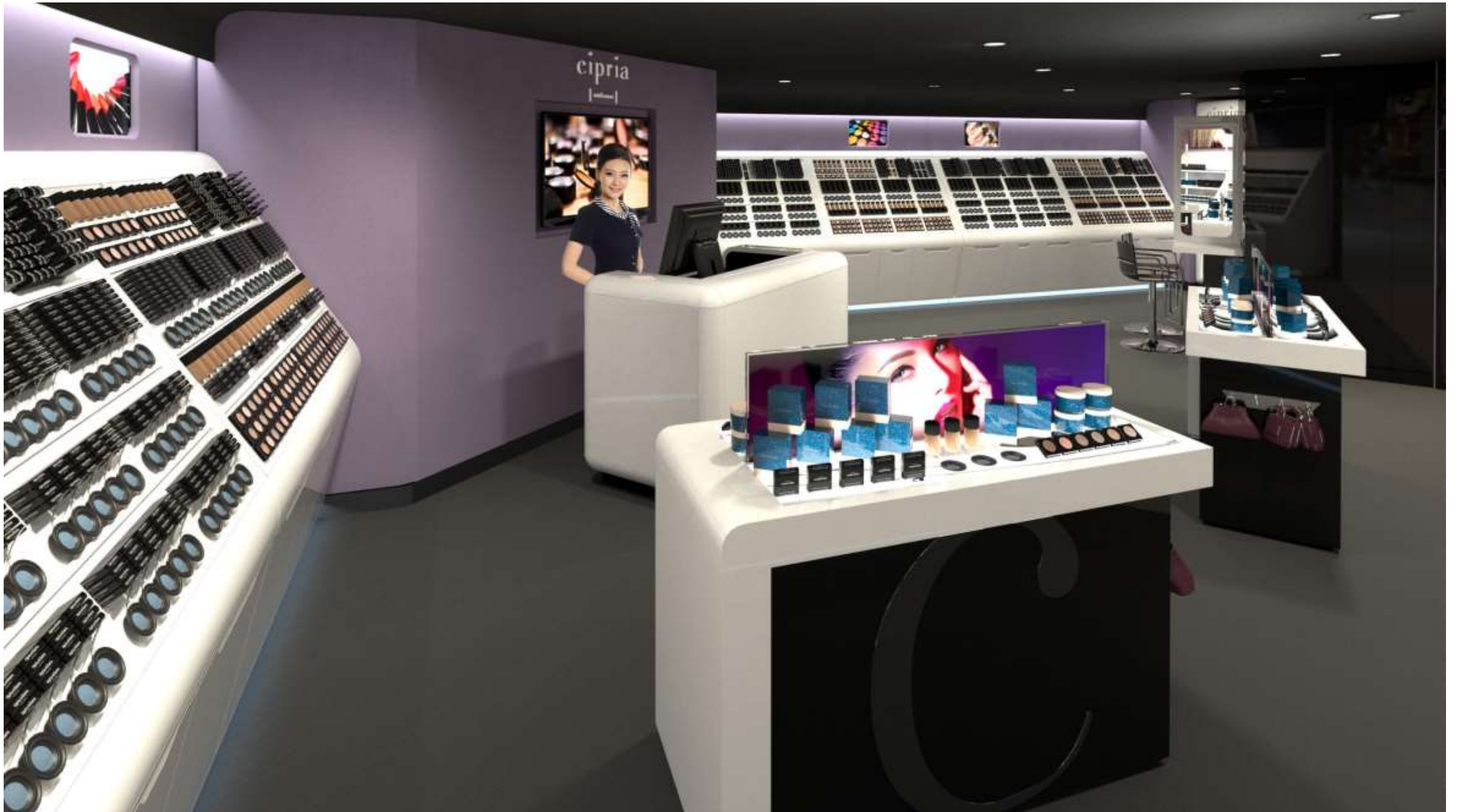
Point of Sale Area